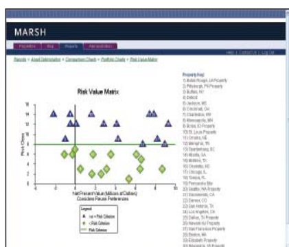
Focus on those properties that will generate the most value

vide a defined process and the tools to help businesses move forward in the decision cycle. Next, businesses can identify where they wish to apply resources to get the best value and results. By providing analytical tools that evaluate a business's entire portfolio, Marsh and RTI International can help bring a complex picture into sharp focus quickly.